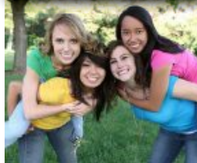
PARK LIFE: Greenwich girls enjoy Maryon Wilson Park.